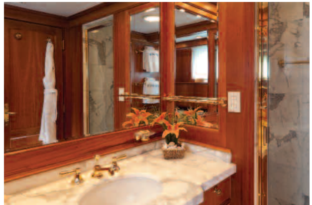
Guest Double Cabin, Guest Twin Cabin, Guest Bathrooms (all identical)