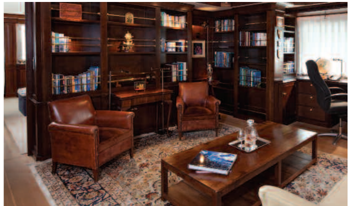
Main Salon and Library