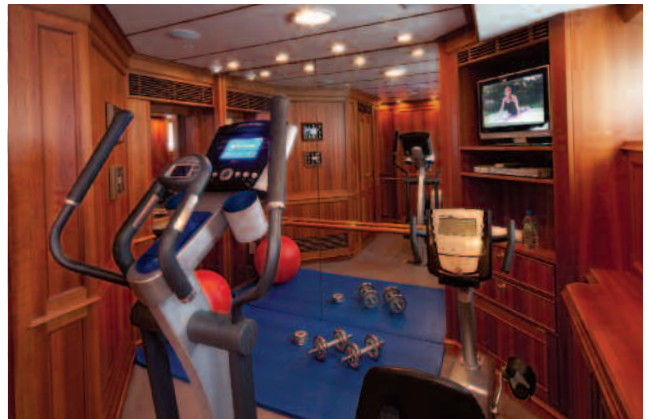
Bridge & Gym