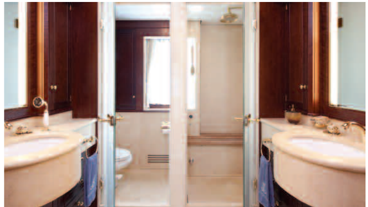
Sun deck, Jacuzzi and Owner's bathroom