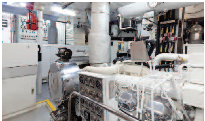
The Engine Room