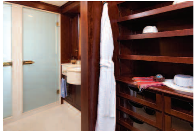
Owner's Cabin, Owner's Sitting Room, Owner's Dressing Room