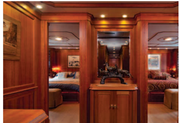
Galley, Main Dining Salon, Guest Cabin Entrances