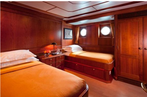
Research Expedition Yacht ' Dione Sky'