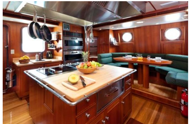
Research Expedition Yacht ' Dione Sky'