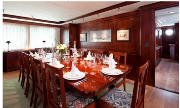
Research Expedition Yacht ' Dione Sky'