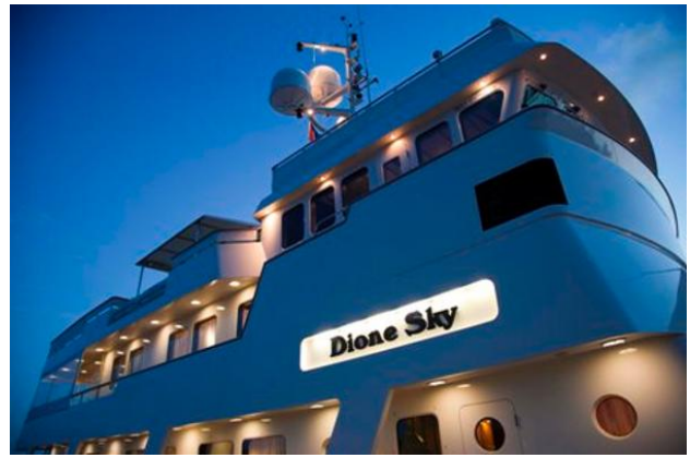
Research Expedition Yacht ' Dione Sky'