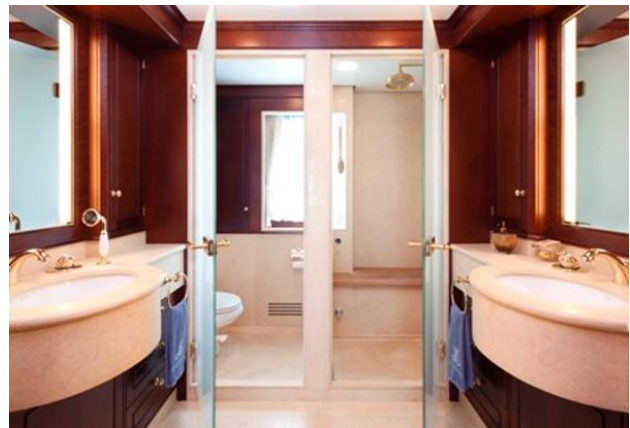
Research Expedition Yacht ' Dione Sky'