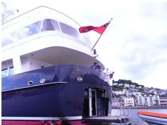
Research Expedition Yacht ' Dione Sky'