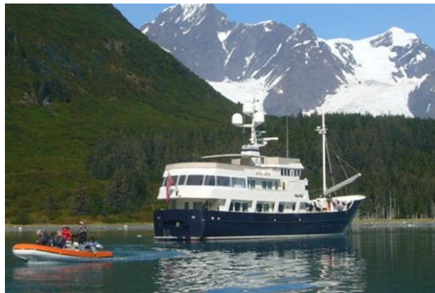
Research Expedition Yacht ' Dione Sky'