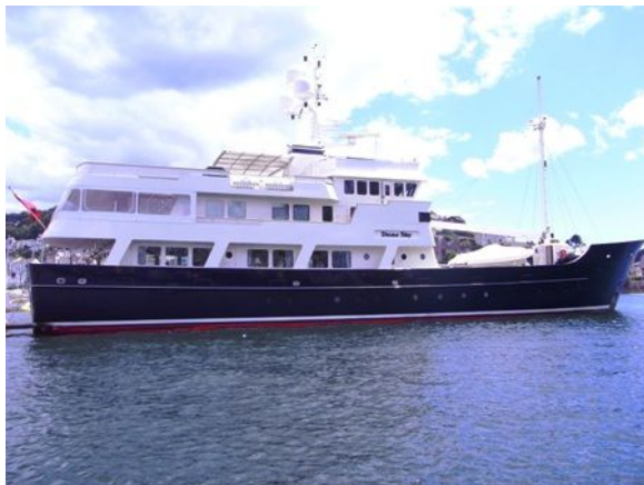
Research Expedition Yacht ' Dione Sky'