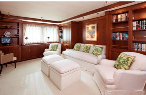
Research Expedition Yacht ' Dione Sky'