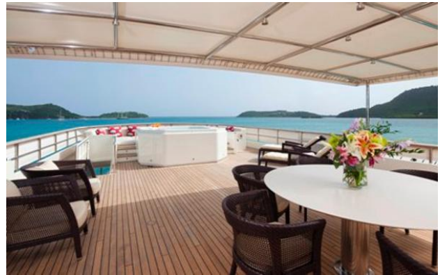
Research Expedition Yacht ' Dione Sky'