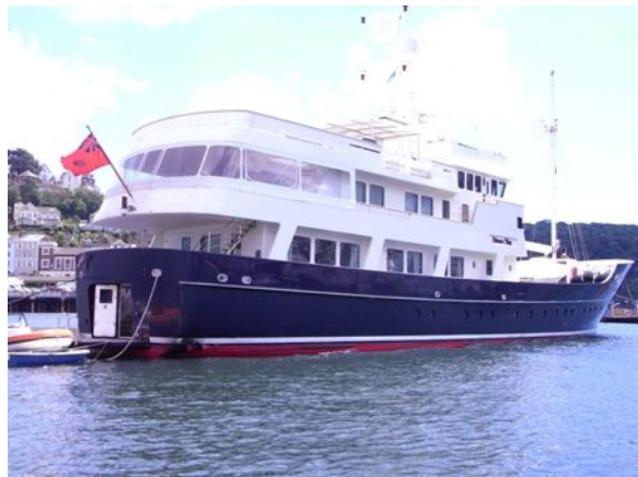
Research Expedition Yacht ' Dione Sky'