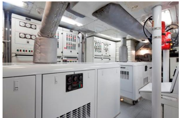
Research Expedition Yacht ' Dione Sky'