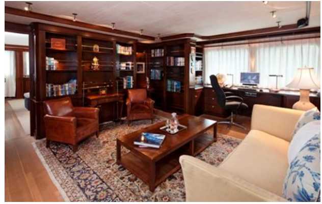
Research Expedition Yacht ' Dione Sky'