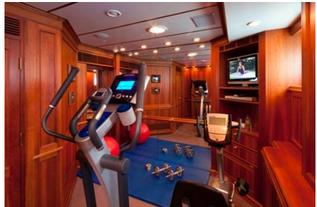
Research Expedition Yacht ' Dione Sky'