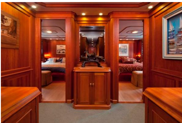
Research Expedition Yacht ' Dione Sky'