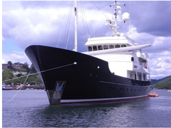
Research Expedition Yacht ' Dione Sky'