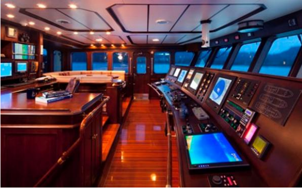
Research Expedition Yacht ' Dione Sky'