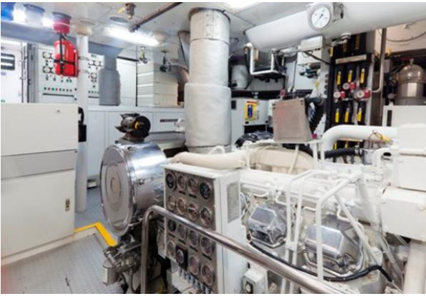
Research Expedition Yacht ' Dione Sky'