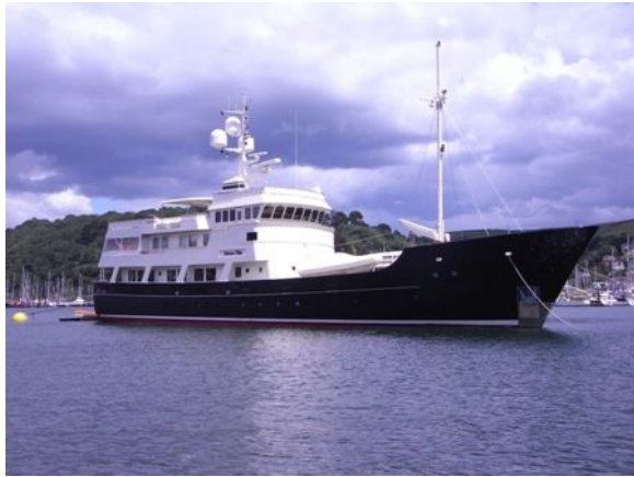
Research Expedition Yacht ' Dione Sky'