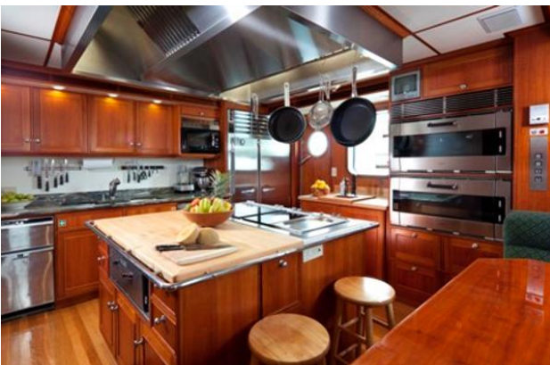
Research Expedition Yacht ' Dione Sky'