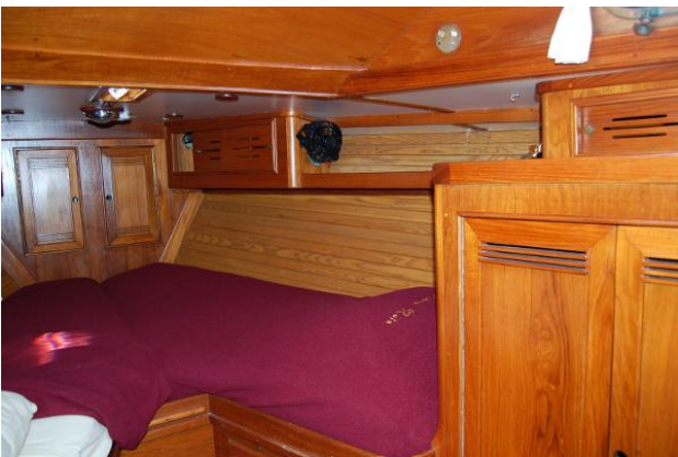
Forward V Berth