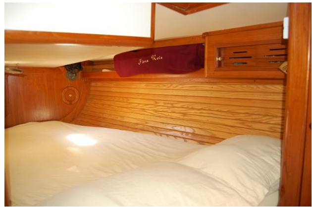
Aft Double Berth