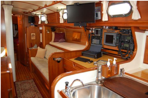
Galley Nav Stn Pilot Berth